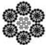
6x36 Warrington Seale with IWRC

Stainless ropes are used in environments which would quickly degrade bright or galvanized ropes. The term "Corrosion Resistant" is technically preferable to "Stainless" because these products are not stainless in all atmospheres. Types 302/304 are offered in all common sizes. Types 305/316 are available on special order. All operating ropes should be lubricated.