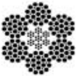
6x25 Filler Wire with IWRC