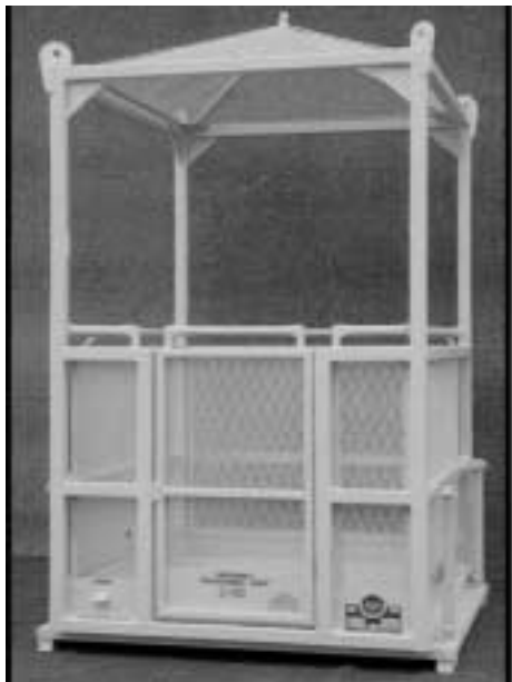
MODEL S-100 48" X 48" X 88"

Shown with optional expanded metal roof & test weight assembly.