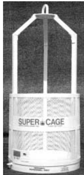
MODEL S-R7 36" O.D. X 88"

Shown with optional expanded metal roof & test weight assembly.